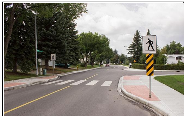
Example of a curb extension.