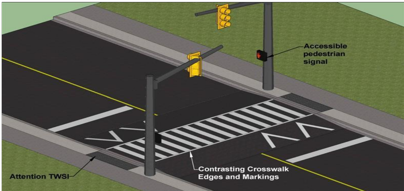
Raised pedestrian crossing at a mid-block crossing.

2. Speed humps/bumps: Speed humps are raised bumps in a roadway are used to reduce traffic speeds. These bumps must be kept well maintained as they can be a hazard for both drivers and bicycles if they are not designed correctly and properly maintained (FHWA ,n.d).